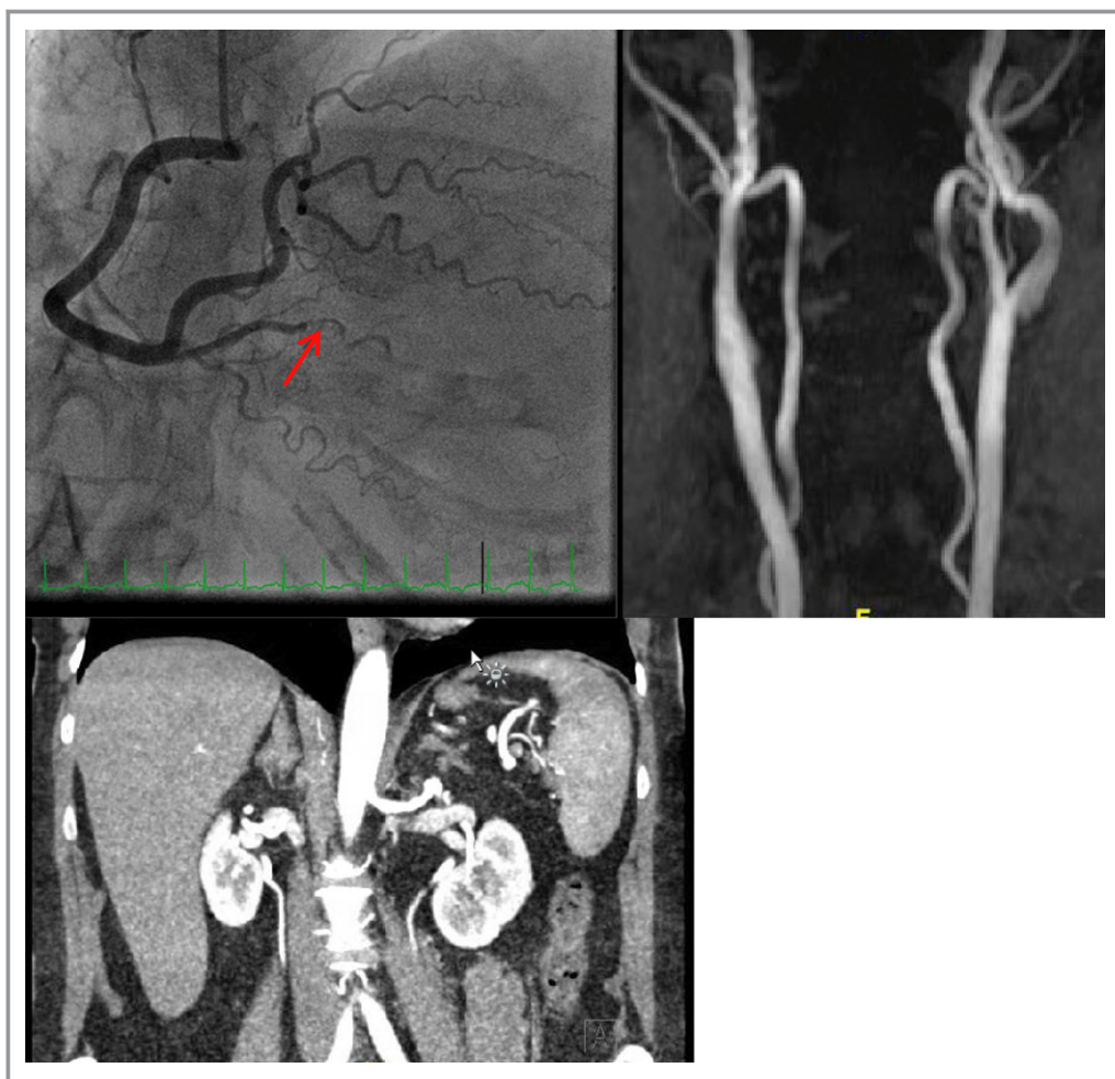
Figure 2. Angiogram of coronary arteries (top left) demonstrating spontaneous coronary artery dissection of the posterior descending artery in a 58-year-old woman presenting with non-ST-segment elevation myocardial infarction. MRA demonstrated bilateral internal carotid artery multifocal FMD (top right), and CTA demonstrated a left renal 6-mm aneurysm (bottom left) with mild FMD of the right renal artery (bottom left). MRA indicates magnetic resonance angiography; FMD, fibromuscular dysplasia; CTA, computed tomography angiography.

Despite the significant prevalence of FMD among patients with SCAD, it is important to note that SCAD and acute coronary syndrome seem to be uncommon events among all comers with a diagnosis of FMD. Indeed, there seems to be an SCAD–FMD paradox: while 25% to 86% of SCAD patients in the largest published case series have imaging evidence of FMD, 31,33,35,36 in the US Registry, any significant coronary artery disease (including atherosclerotic disease) was reported in only 6.5% of patients, and only 3.1% of patients in the US Registry had a history of myocardial infarction. 2 To summarize, SCAD seems to be the primary coronary artery manifestation of FMD, and unlike other vascular beds, coronary FMD infrequently presents as a “string of beads.” 37 While underlying FMD is common among patients who have sustained an SCAD event, only a small percentage of patients with FMD develop coronary events during follow-up. Future research efforts are needed to determine the predictors of